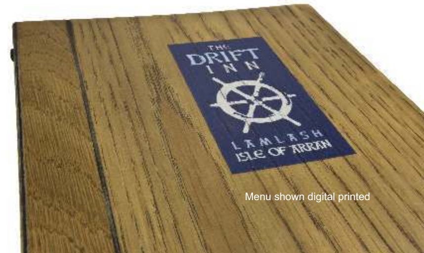
Menu shown digital printed