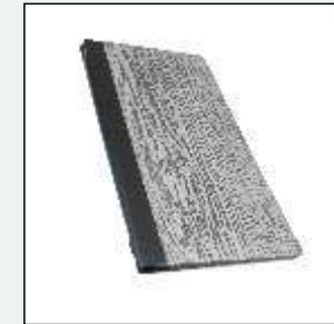
Salt & Pepper Oak