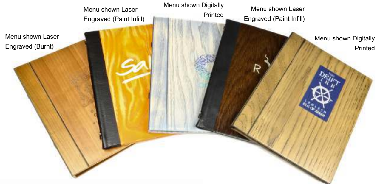
Menu shown Laser Engraved (Paint Infill)

One time setup charge : £15.00 on qty less than fifty