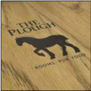
Laser Engraved (Paint Infill) (Based on area 80mm Sq.)