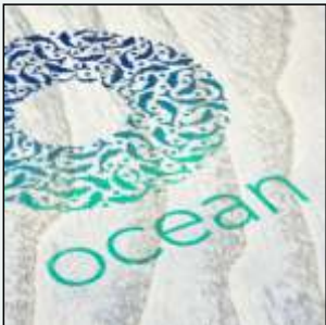
Digital Printing (Full Colour) (Based on area 80mm Sq.)