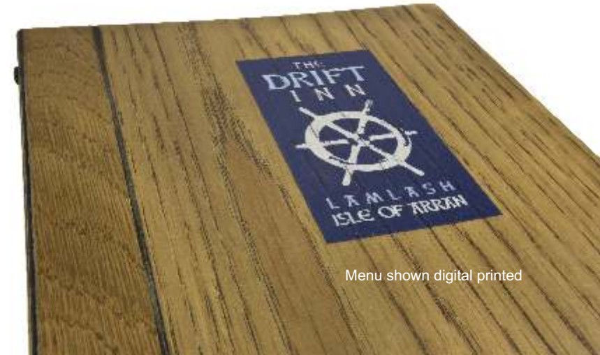
Menu shown digital printed