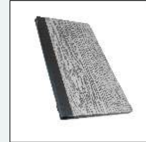
Salt & Pepper Oak