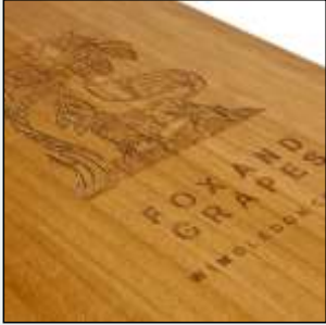
Laser Engraved (Burnt Effect) (Based on area 80mm Sq.)