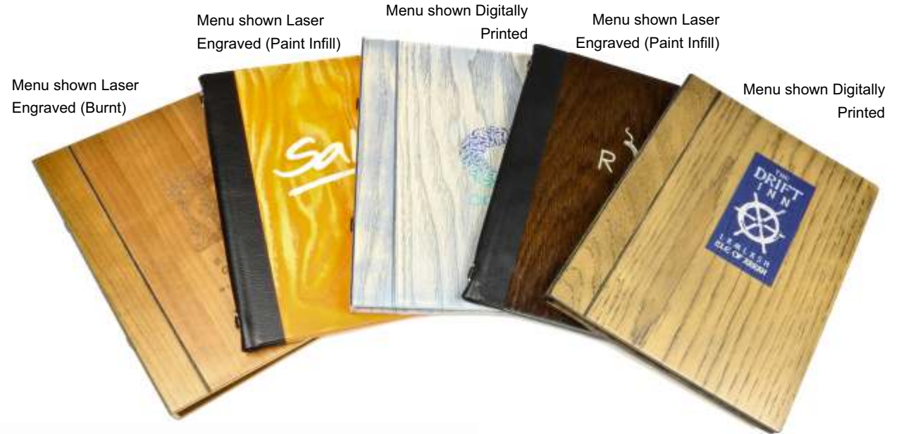
Menu shown Laser Engraved (Paint Infill)

One time setup charge : £15.00 on qty less than fifty